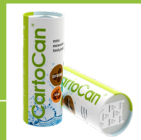
CartoCan ® liquid