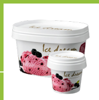
CartoCan ® conic