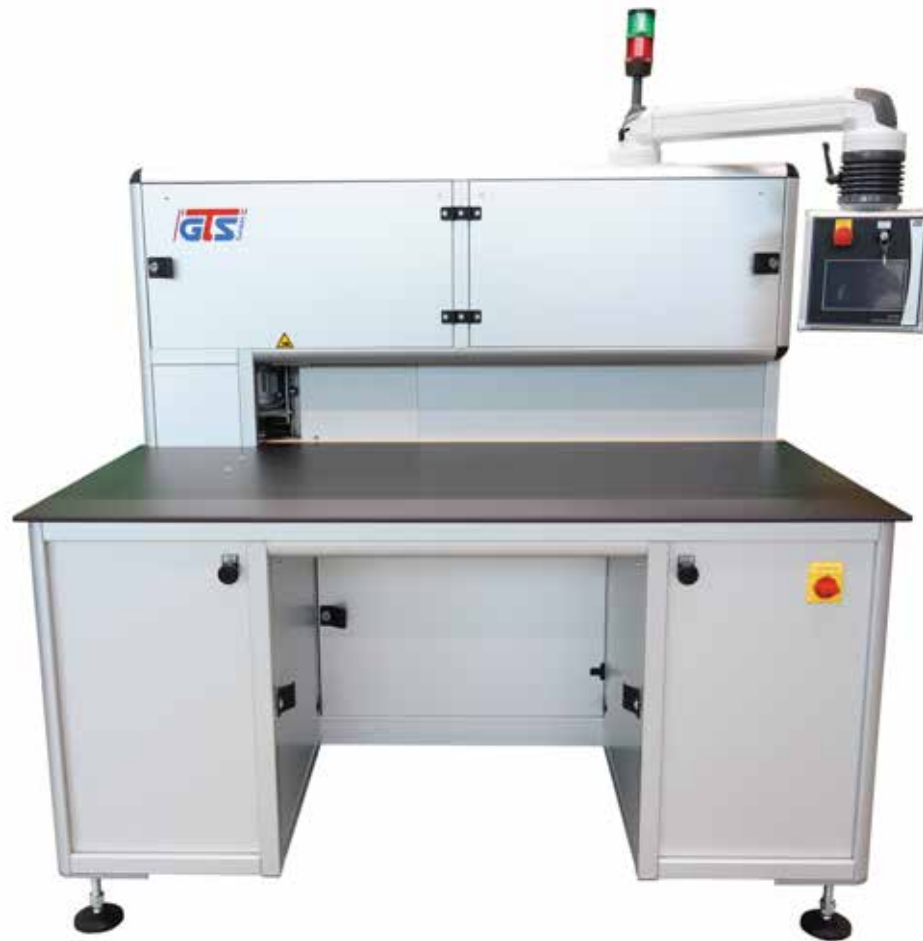
Single head counting machine